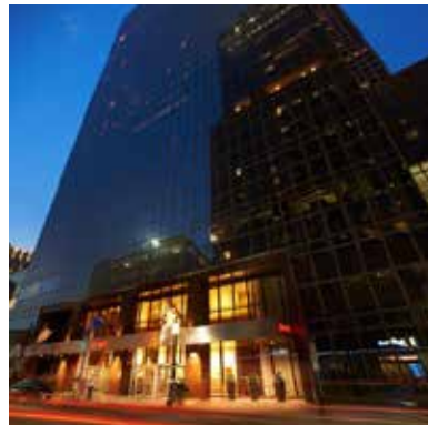
USPS Governing Board August 12-18, 2018 Minneapolis, MN