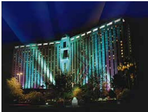
USPS National Meeting February 18-24, 2018 Orlando, FL